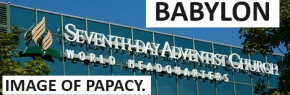
IMAGE OF PAPACY.